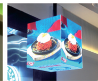
Five sided suspension