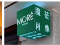
Outdoor waterproof LED Rubik's cube screen