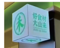
Hanging on all sides